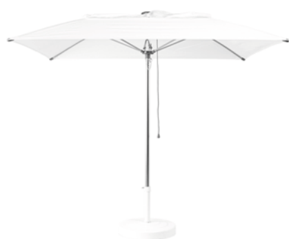
White U4 501 096

The measurements shown are average values and may vary slightly depending on the product.