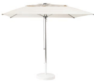
Beige U4 501 003