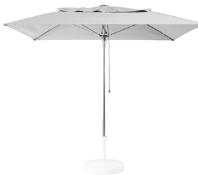
Grey U4 501 235