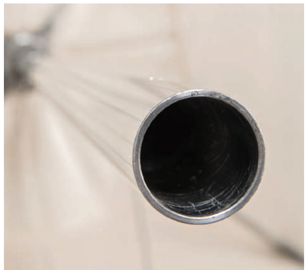
38 mm dia. anodised aluminium central pole. Tube thickness 2.5 mm