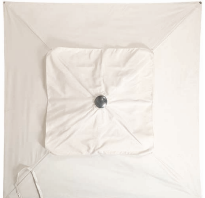
XL chimney - integrated reinforcing ribs