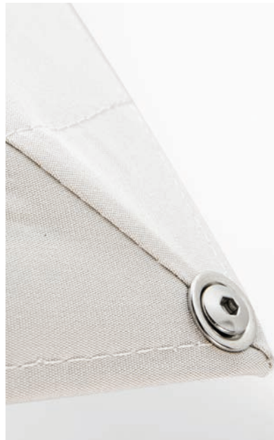
Stainless steel screws and accessories