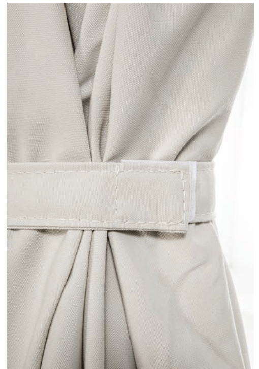
Velcro fabric closure