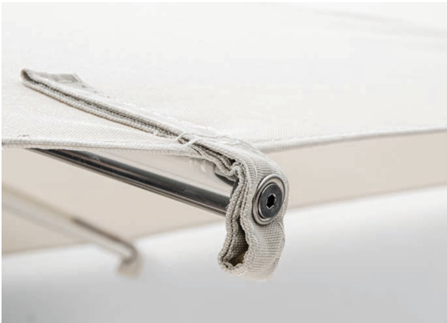
Stainless steels screws