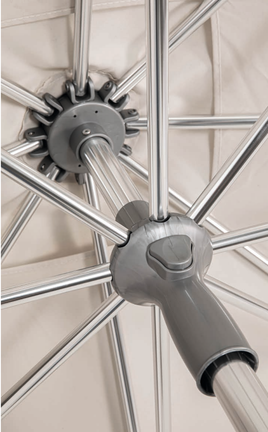
Low mast: \varnothing 35 mm Thickness : 5 mm