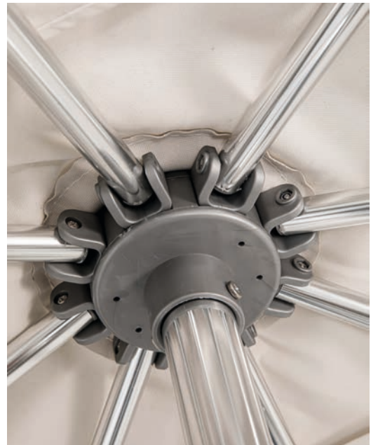
Tubular frames \varnothing 19 mm Thickness 1,2 mm